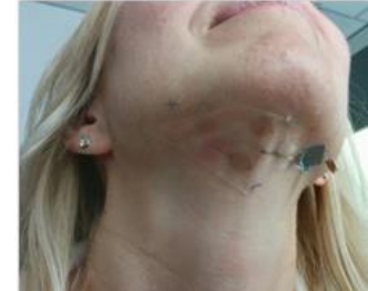
Figure 2 - Epidermal sEMG patch [4]

Thirdly, we demonstrate that a skin-adhesive electronic device from hard/soft material integration has a potential to aid patient populations in clinical setup [4]. Here, an emerging technology, called "epidermal electronics", is introduced. where ultra-thin geometry allows for intimate and comfortable contact to patients' chin, just like a temporary tattoo (Fig 2). The two objectives of this study were to assess the potential of epidermal electronics technology for swallowing therapy. This study showed comparative signals between the new epidermal sEMG patch and the conventional adhesive patches used by clinicians for swallowing therapy.