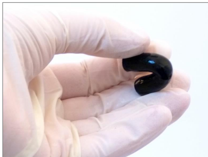
Figure 2 – Polyaniline cryogel: soft, flexible, conducting