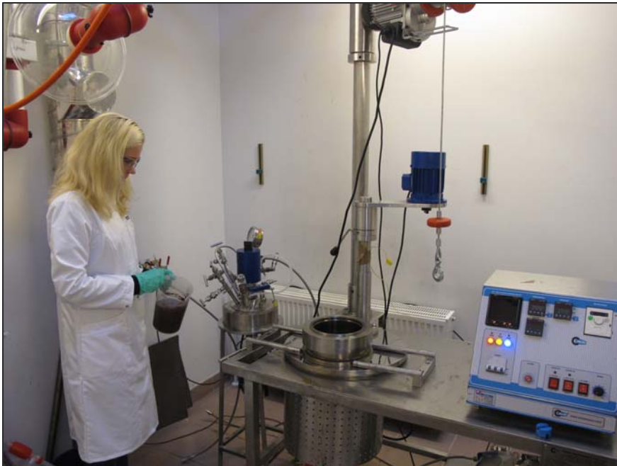
10-l Hastelloy C276 stirred autoclave reactor at VTT