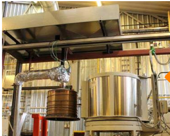
Bench scale pyrolysis unit at VTT

Willow ( Salix ), Scots pine bark, Scots pine forest residue, wheat straw