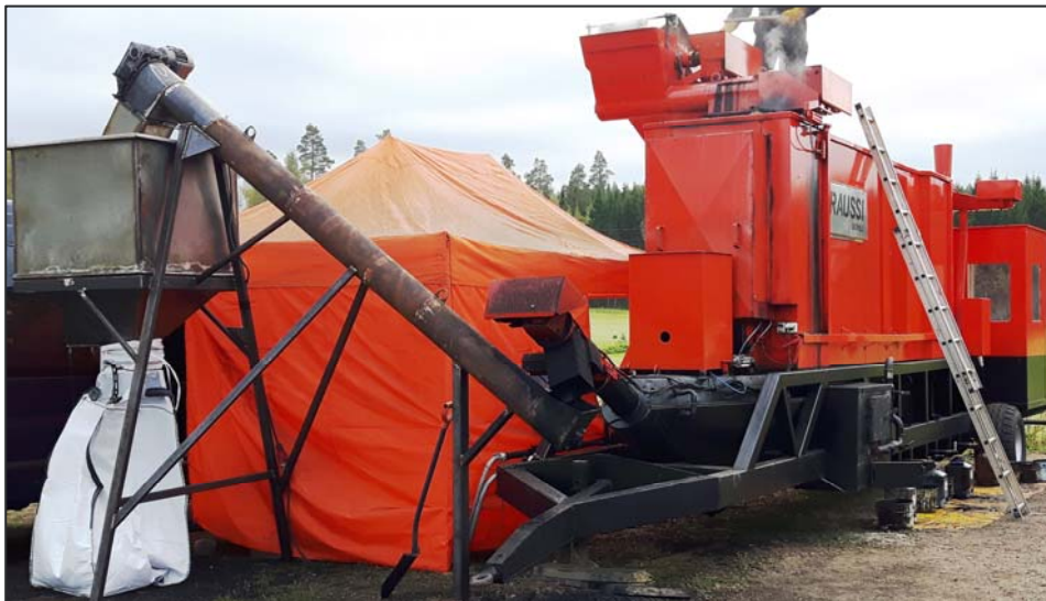
Pilot version of mobile pyrolysis unit (RAUSSI OY)