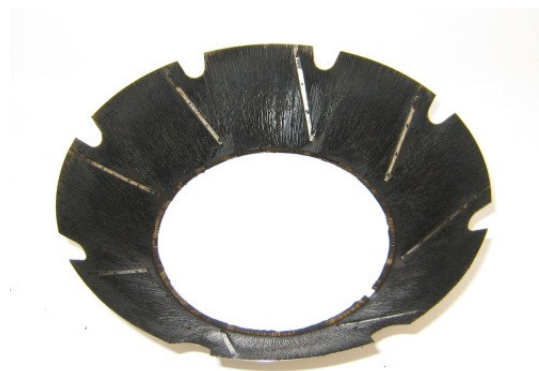
Fig. 2 A typically fouled insert disc obtained from a lube oil separator.

On this special occasion the separator was put off stream, dismantled and a few fouled discs were replaced by new ones in order to have samples for laboratory experiment. The visual appearance of a lube-oil fouled insert disc is presented in Fig. 2. An example of the chemical composition of the lube oil fouling sludge is given in Table 1.