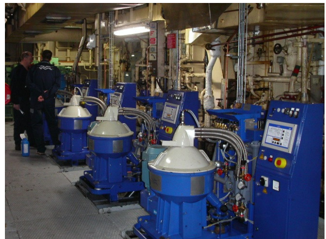
Fig. 1 The S831 lube oil separators on board the ship MS Isabella.

The Alfa Laval S831 lube oil separator displayed in Fig. 1 (the one under inspection) had been in operation for 1429 hours since time of installation. It serves one of the four main engines and continuously cleans approximately 10 m 3 lube oil at a temperature of 95 °C. It is common practice to clean lube-oil fouled separators by hooking up a CIP unit allowing the hot CIP cleaning solution to circulate for one hour between the CIP unit and the running separator. Subsequently, the dirty cleaning solution is discharged and the procedure is repeated once again. If the result is not satisfactory, it follows that the interval between CIP is too long. The discs should then be cleaned manually and the next CIP treatment should consequently be performed after a shorter period of time. As a CIP bonus the heater may be connected concomitantly between the CIP unit and the separator.